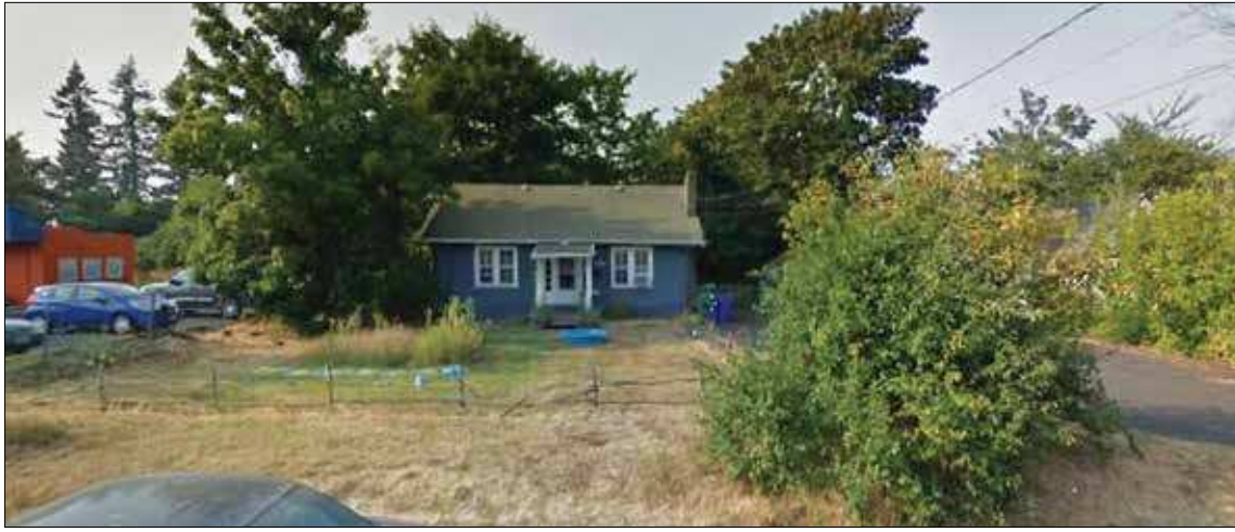
An image from Google search shows the property in the Cully Neighborhood at 5827 N.E. Prescott St. where the Portland Housing Bureau plans to develop at least 50 new units of affordable housing with funds from the Portland Housing Bond.