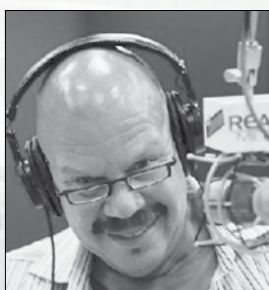
Tom Joyner 3am - 7am

KBMS Radio 1480 AM Portland's best music station