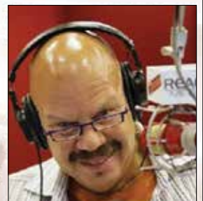
Tom Joyner 3am - 7am

KBMS Radio 1480 AM Portland's best music station