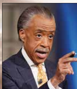
Rev. Al Sharpton 10am - 1pm