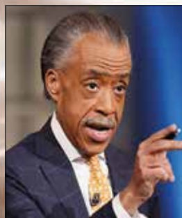
Rev. Al Sharpton 10am - 1pm

Listen Live At Portlandmedium.com (Click On KBMS icon)