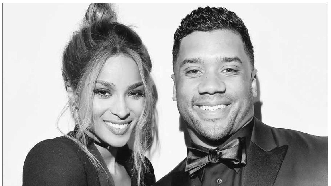
Singer Ciara and her husband, Seattle Seahawks quarterback Russell Wilson are new financial backers of an effort to build a professional baseball stadium and lure a Major League team to Portland.