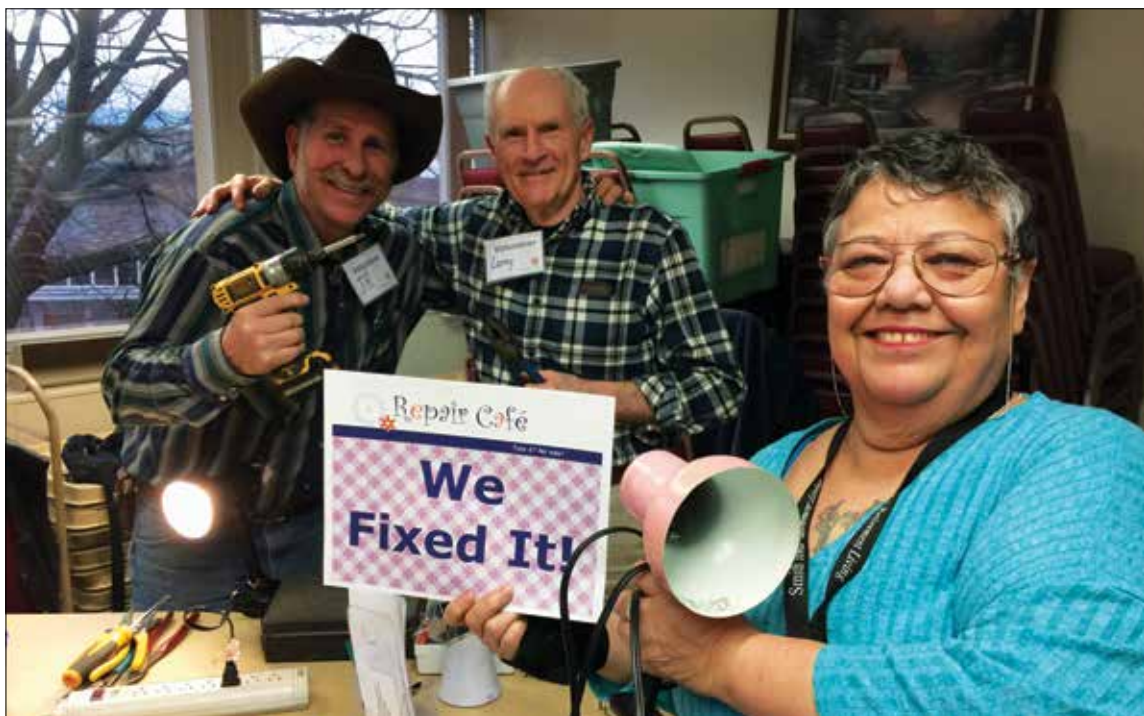
Volunteers with the Clark County Repair Cafe help a participant repair her lamp.