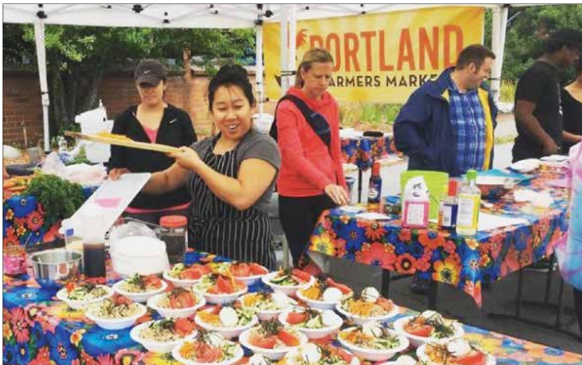
Cooking and crafting classes return this summer to the King Portland Farmers Market which is held each Sunday at King School Park in northeast Portland.