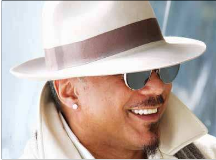
Legendary R & B singer and songwriter Howard Hewett, the former lead vocalist from the 1980s group Shalamar, will headline the annual Good in the Hood music festival returning to King School Park, June 22-24.