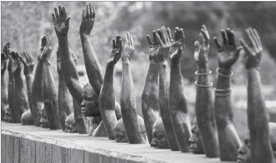
A bronze statue called "Raise Up" is part of the display at the new National Memorial for Peace and Justice in Montgomery, Ala. a new memorial to honor thousands of people killed in lynchings.