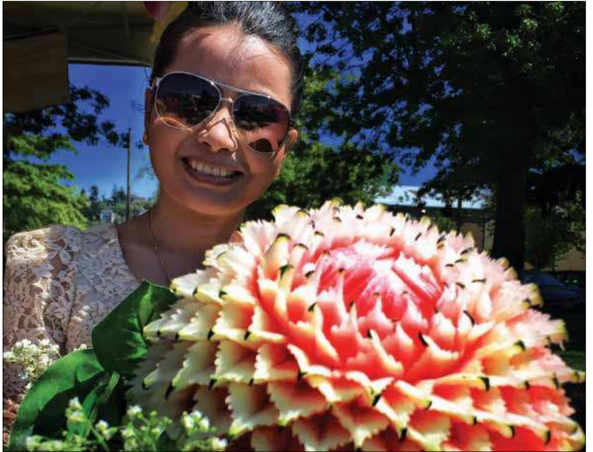
A melon is transformed into a flower during the annual celebration of Southeast Asian culture and heritage called "New Year in the Park," an annual event returning to Glenhaven Park in northeast Portland on Saturday, April 28 from 9:30 a.m. to 6 p.m.