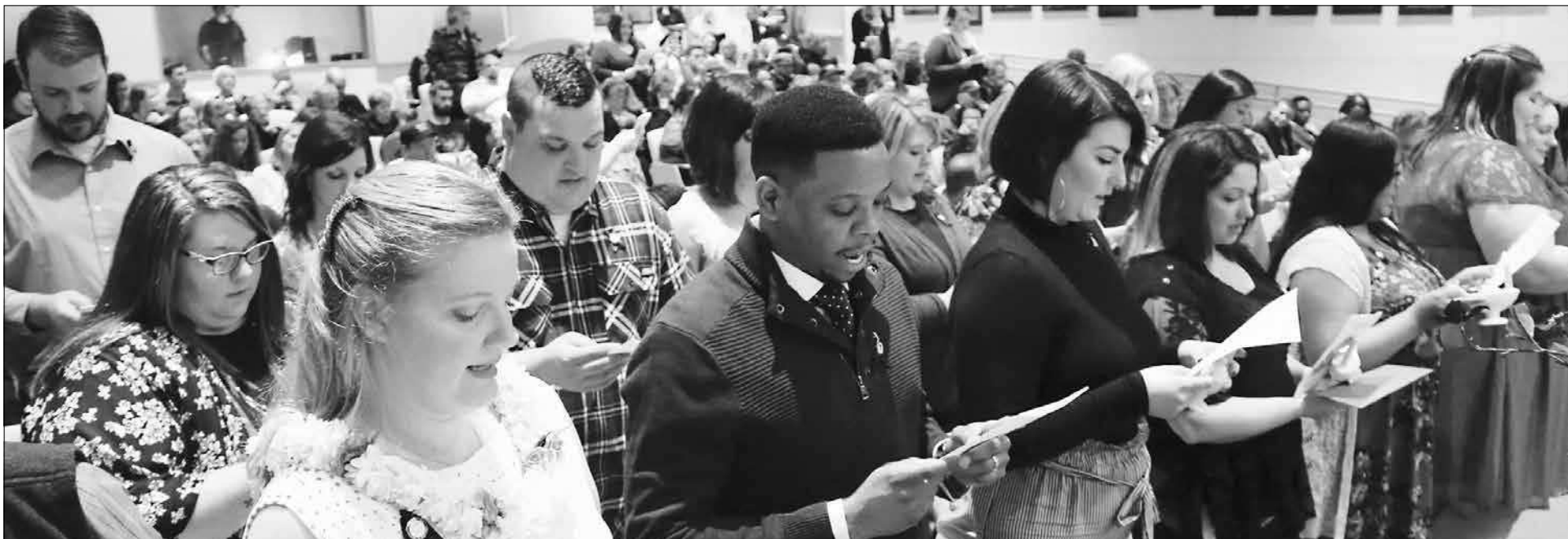
Students in nursing complete their studies at Portland Community College after their ITT Tech school went bankrupt in 2016.