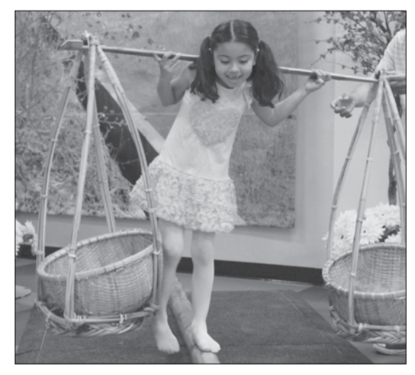
Voyage to Vietnam -- Portland Children's Museum promotes the understanding of Vietnam culture and showcases the traditions, customs and values exemplified by the country's annual celebration of Tet with Voyage to Vietnam: Celebrating the Tet Festival. The new exhibit runs through May 6.