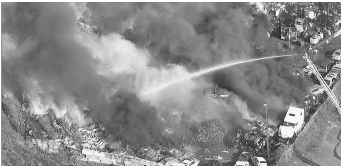
Firefighters douse water on a huge fire that erupted at a scrap yard near Northeast 76th and Killingsworth Street Monday, sending toxic smoke throughout the city, destroying a nearby apartment and duplex, killing several pets and causing the evacuations of hundreds of residents.