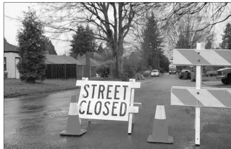
Several streets in the Cully Neighborhood of northeast Portland remained closed Tuesday, the day after a huge scrap yard fire nearby erupted into flames and smoke. The cause of the fire was under investigation.

The public can sign up for public safety alerts at PublicAlerts.org for the latest information, call 211 for shelter assistance, and call 503-823-2323 for transportation assistance.