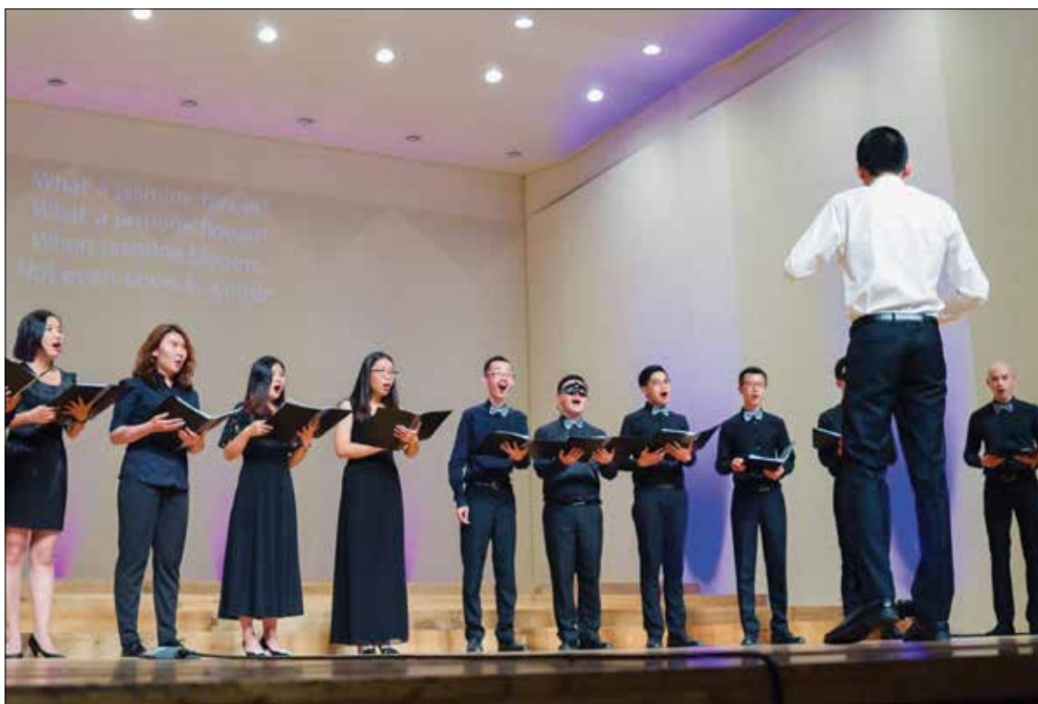
Uplifting its mission to affirm the worth of all people, Portland's Gay Men's Chorus will feature special guest artists, the Beijing Queer Chorus, during two 'Pacific Voices' concerts, Saturday and Sunday, March 17-18 at Kaul Auditorium at Reed College in southeast Portland.