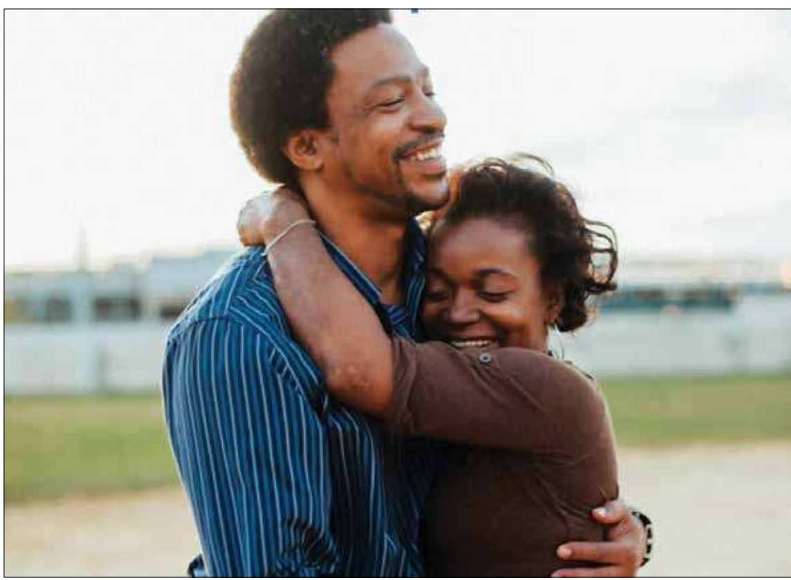
An intimate portrait of an African-American family from Philadelphia, facing the same issues of inequality and neglect that plagues so much of America's urban landscape, is captured in the documentary "Quest," which gets a Northwest Film Center screening over three nights at the Portland