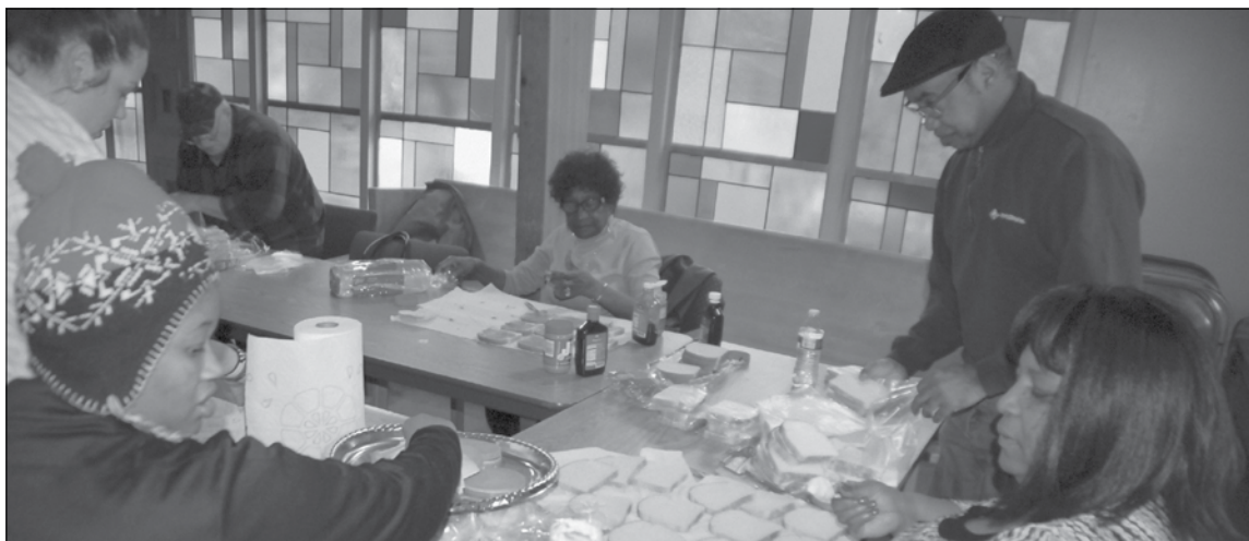
Hughes Memorial United Methodist Church volunteers prepare sandwiches every fourth Saturday of the month for donations to the homeless. The northeast Portland church hopes to expand the effort to as much as weekly in the future.