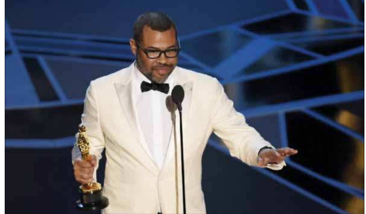
Jordan Peele became the first African American to win an Oscar for best original screenplay for his film 'Get Out,' at Sunday's 90th annual Academy Awards.

A local version of net neutrality passed both houses in the Oregon Legislature last week and is headed for the governor's desk. The bill would prevent public bodies such as state and local governments and school districts, from contracting with broadband providers that engage in "paid prioritization." Three students from Mt. Tabor Middle School testified in support of the measure.