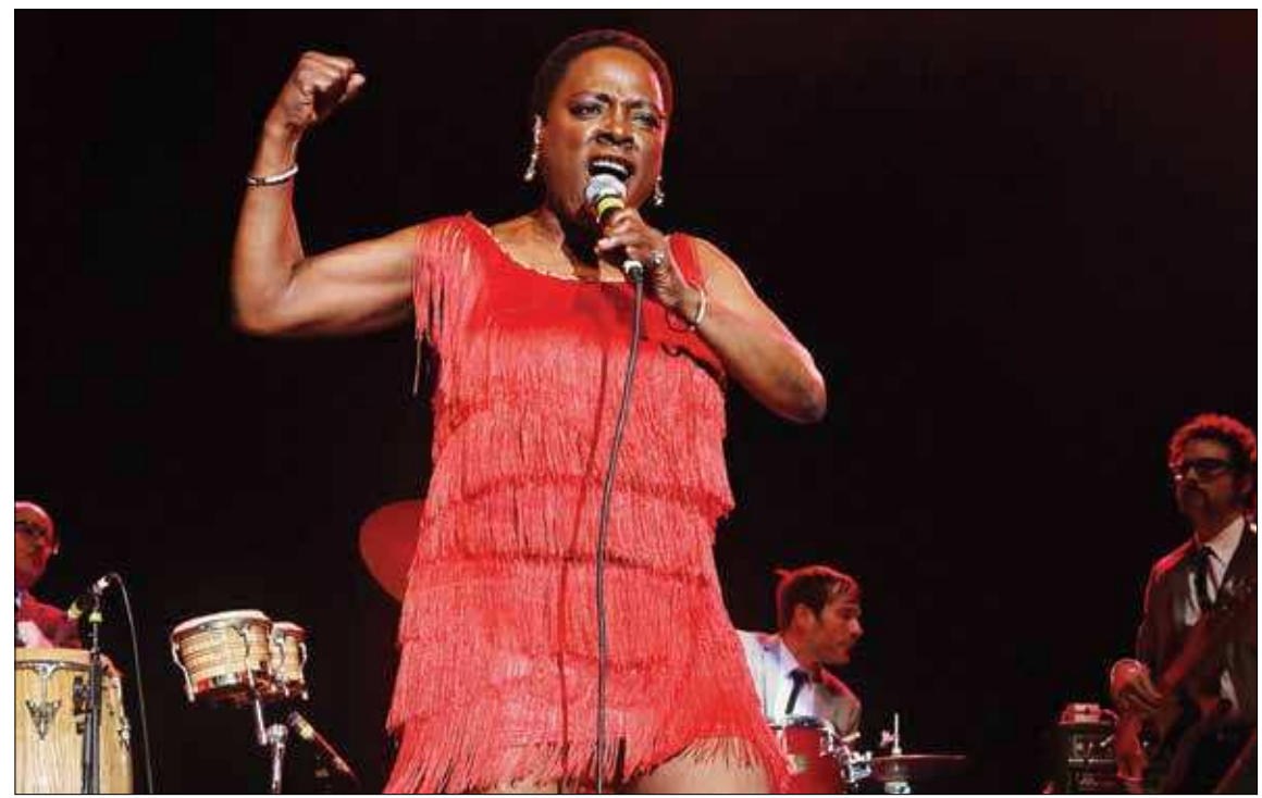
A talented and gregarious soul singer struggles to find her health and voice again in "Miss Sharon Jones," one of more than dozen movies to get a screening for Women's History Month during the month of March at the Hollywood Theater in northeast Portland.