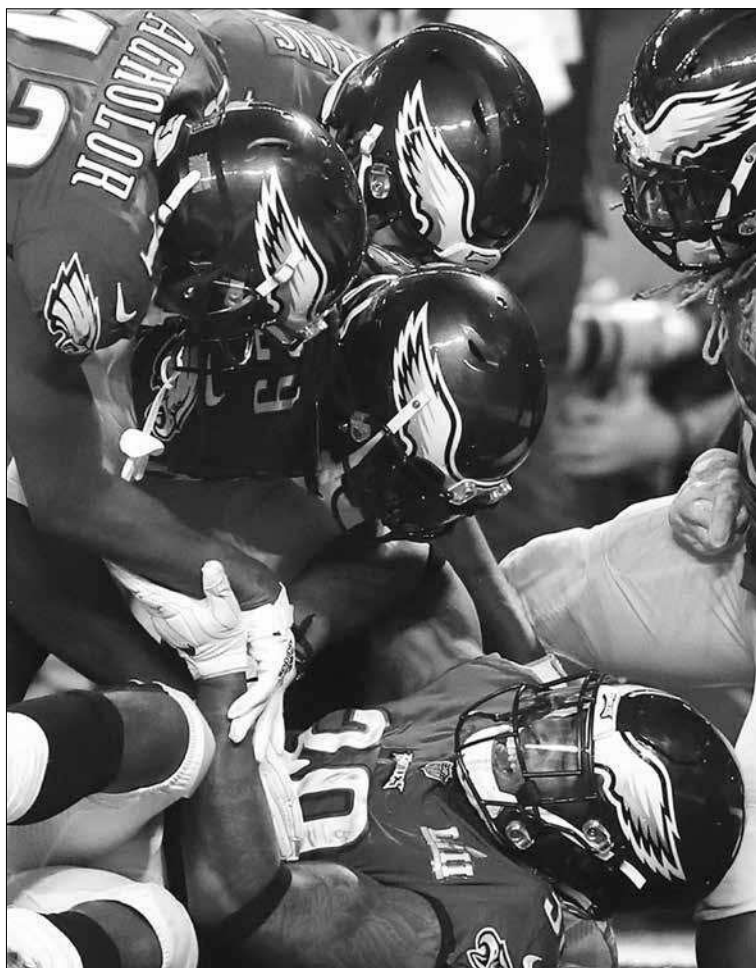
Philadelphia Eagles' Corey Clement celebrates his touchdown catch during the second half of the Super Bowl against the New England Patriots Sunday in Minneapolis.