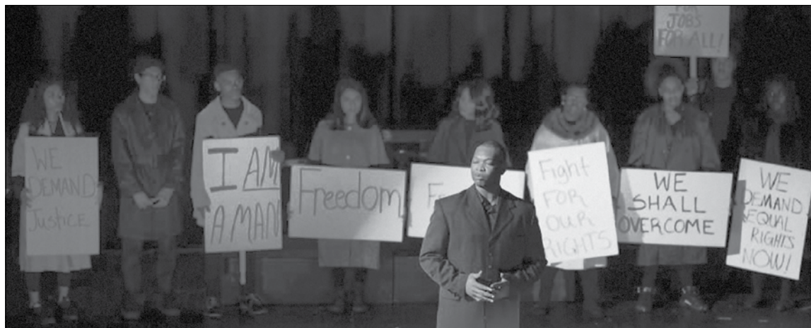
World Stage Theater actors recreate the historic 'March on Washington' and Martin Luther King Jr.'s 'I Have a Dream' speech during a performance of 'Who I Am Celebrating Me.'