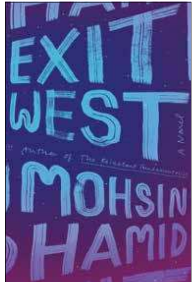
Moshin Hamid a Pakistani writer who explores conditions of human displacement and migration in his 2017 novel ‘Exit West,’ is this year’s featured book and author for Multnomah County Library’s ‘Everybody Reads’ program.