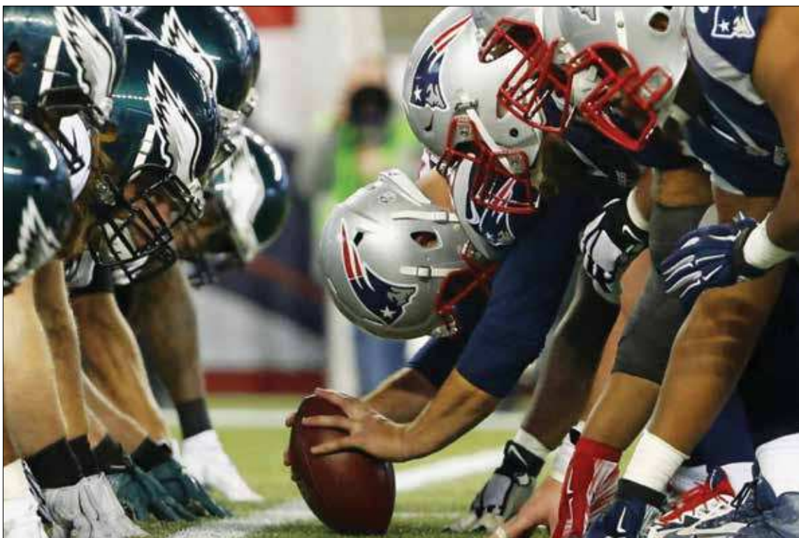
The Philadelphia Eagles and the New England Patriots will square off for the NFL Championship in Minnesota Sunday when Super Bowl LII kicks off at 3:30 p.m. in a game to air on NBC, Channel 8.