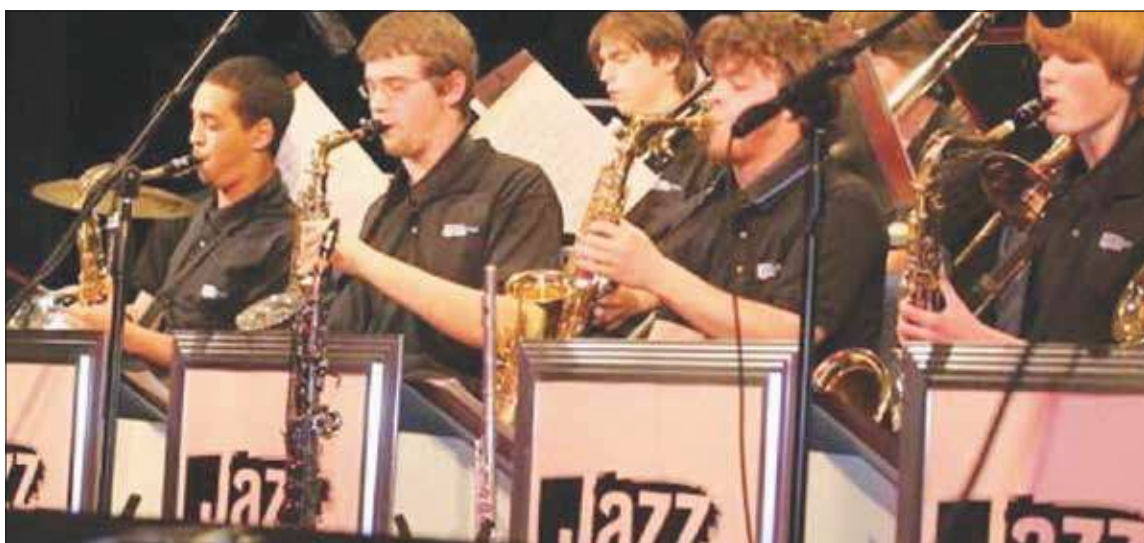
The annual Clark College Jazz Festival brings musicians from over 60 area schools for three days of exhilarating big band jazz.