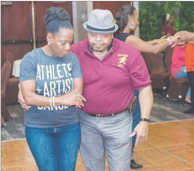
Members of Portland's Groovin' High Steppers enjoy the group's Chicago-style steppin' dance classes and social events.