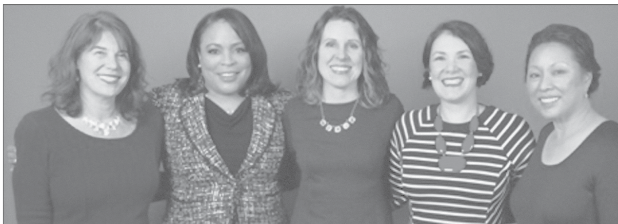
The Multnomah County Board of Commissioners as pictured in a photo from last January when the governing body started the year as the first such group in which all members represented women and minority groups for the first time ever. After some recent tensions on the board, a new statement signed by each commissioner focuses on restoring trust.