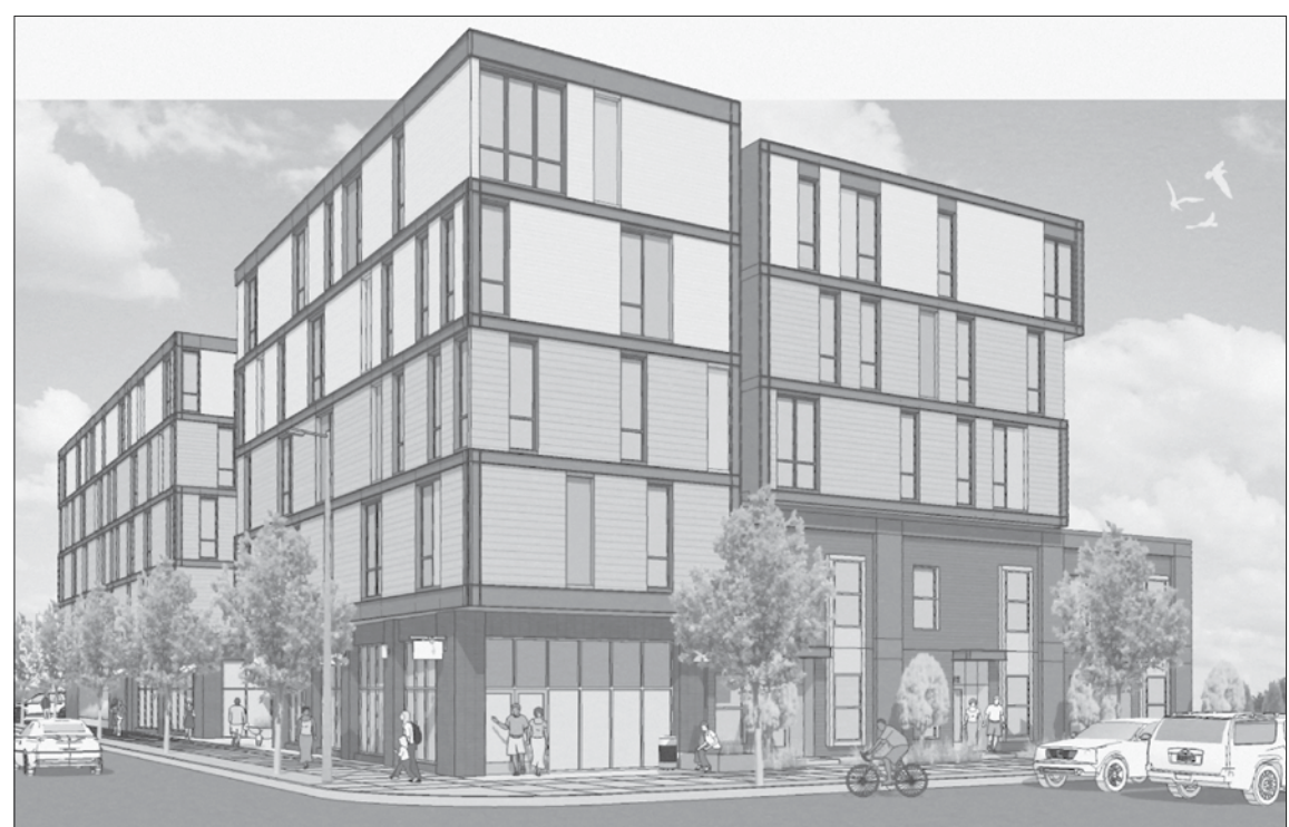
A preliminary drawing shows the proposed affordable housing condominium project planned for North Interstate Avenue by the nonprofit Proud Ground.