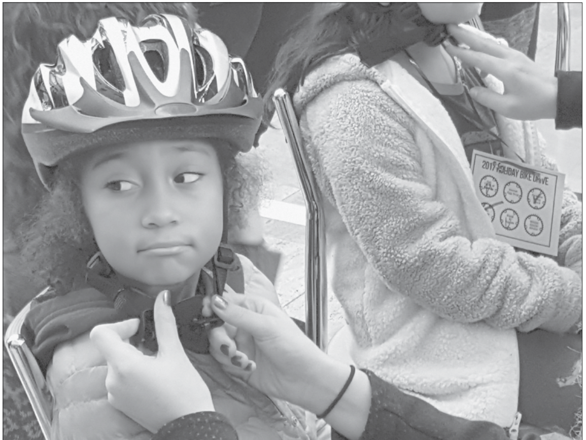
With multi-sport style helmets in a variety of colors for adults and children, Legacy Emanuel Medical Center will host a free and reduced price bike helmet program on Saturday to promote safety and reduce the risk of injuries.