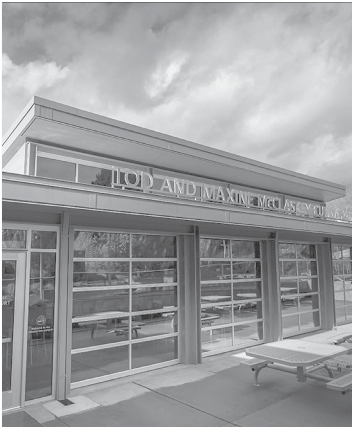
Clark College in Vancouver opens the McClaskey Culinary Institute, a modern facility providing healthy dining options and space for its culinary arts curriculum.