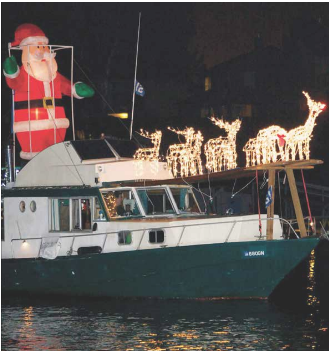
The beloved holiday tradition featuring boats decorated with festive lights will be visible from the M. James Gleason Memorial Boat Ramp on the Columbia River across from the Portland Airport on scheduled nights in December.