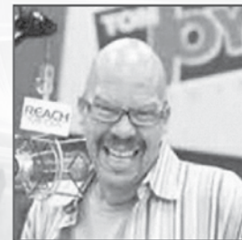
Tom Joyner 3am - 7am

KBMS Radio 1480 AM Portland's best music station