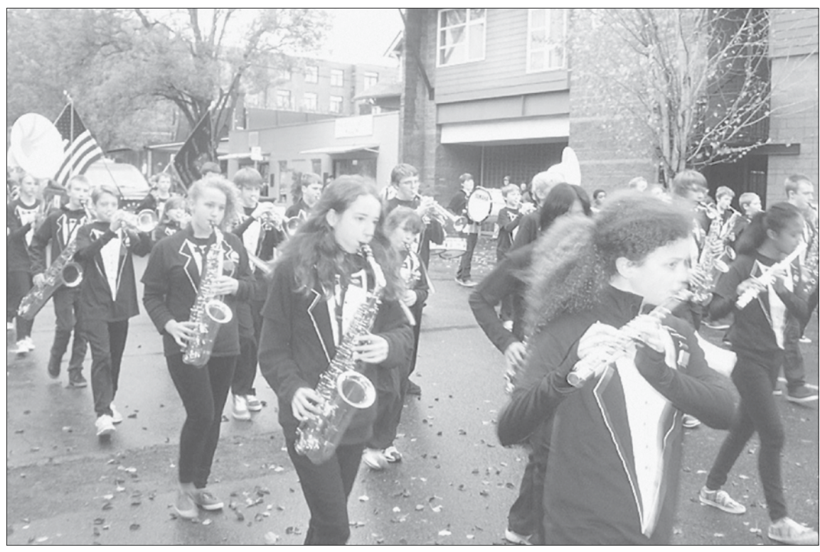
Local marching bands salute men and women of the armed forces past and present at the annual Veterans Day Parade, returning Saturday, Nov. 11 at 9:30 a.m. to the Hollywood district of northeast Portland.