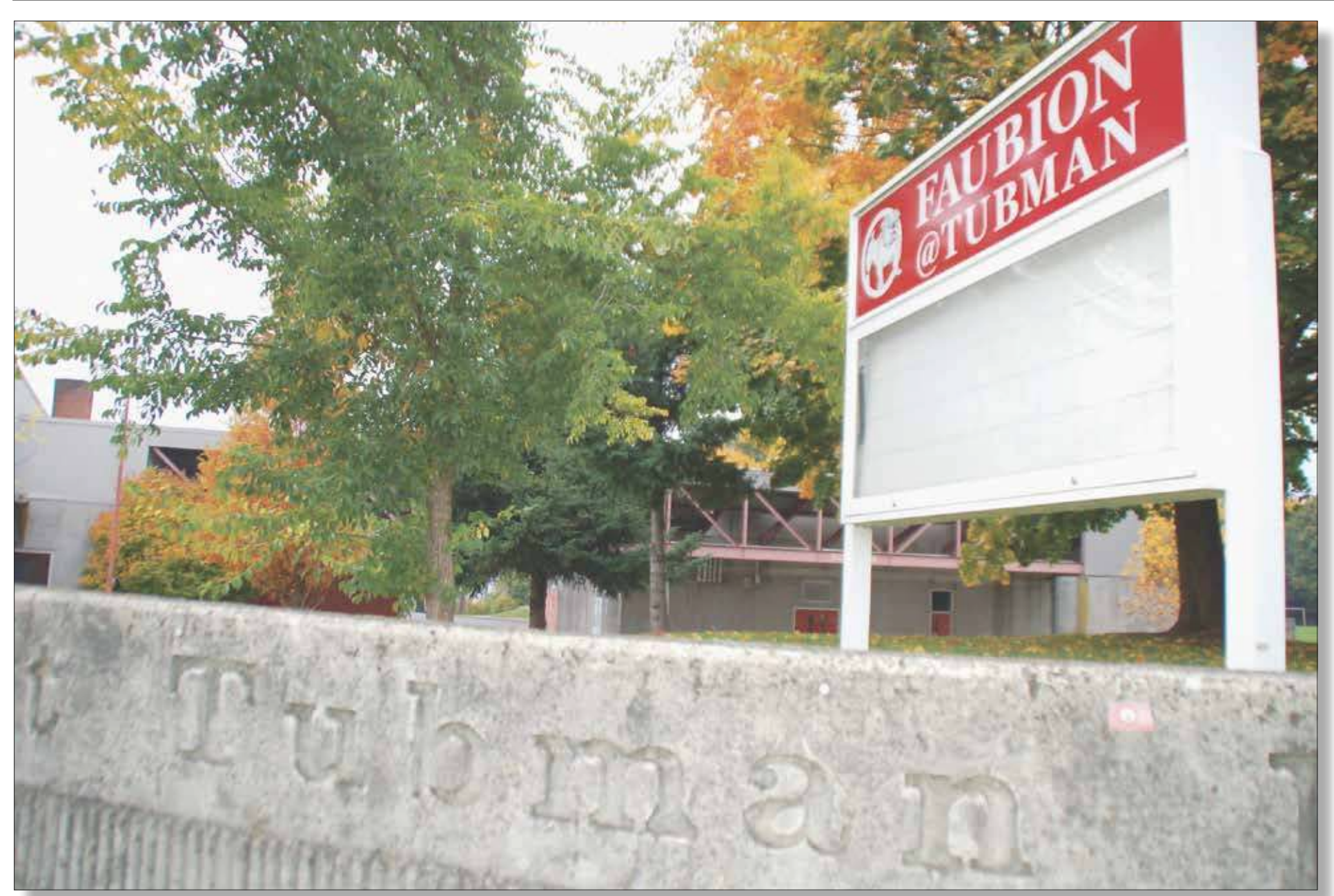
Portland Public Schools wanted to reopen Harriet Tubman Middle School to expand options and build a stronger program to serve more students, especially from the African American community, but those plans are now on hold pending a review of the physical condition of the school and from environmental impacts like air pollution.