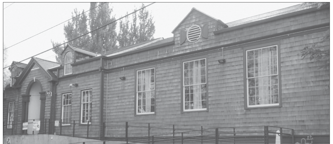
Po'Shines Café De La Soul will begin serving its Cajun and barbecue soul food specialties at the historic Billy Webb Elks Lodge at 6 N. Tillamook St.