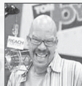
Tom Joyner 3am - 7am

KBMS Radio 1480 AM Portland's best music station