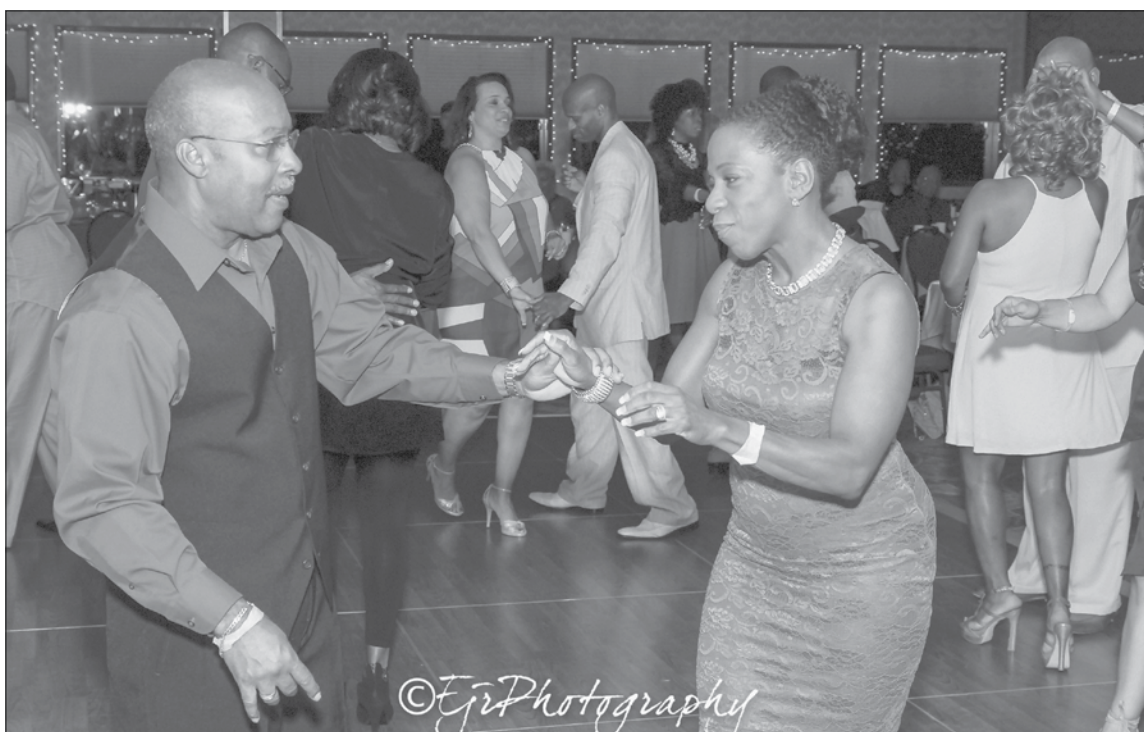
Groovin' High Steppers take dancing to the next level. The African American swing dance group is ready to host its fifth annual soiree weekend, Oct. 13-15.