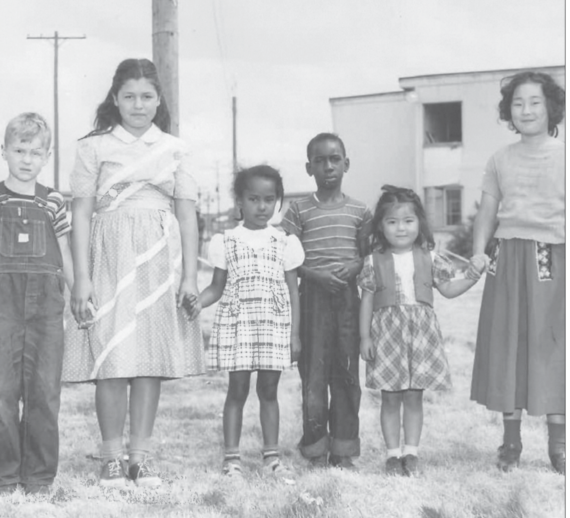
A photo from the Oregon Historical Society shows a group of young refugees displaced by the Vanport Flood in 1948.

810 N. Rosa Parks Way, Portland, OR 97217 503 719 5907 503 544-0947