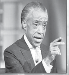
10am - 1pm

Listen Live At Portlandmedium.com (Click On KBMS icon)