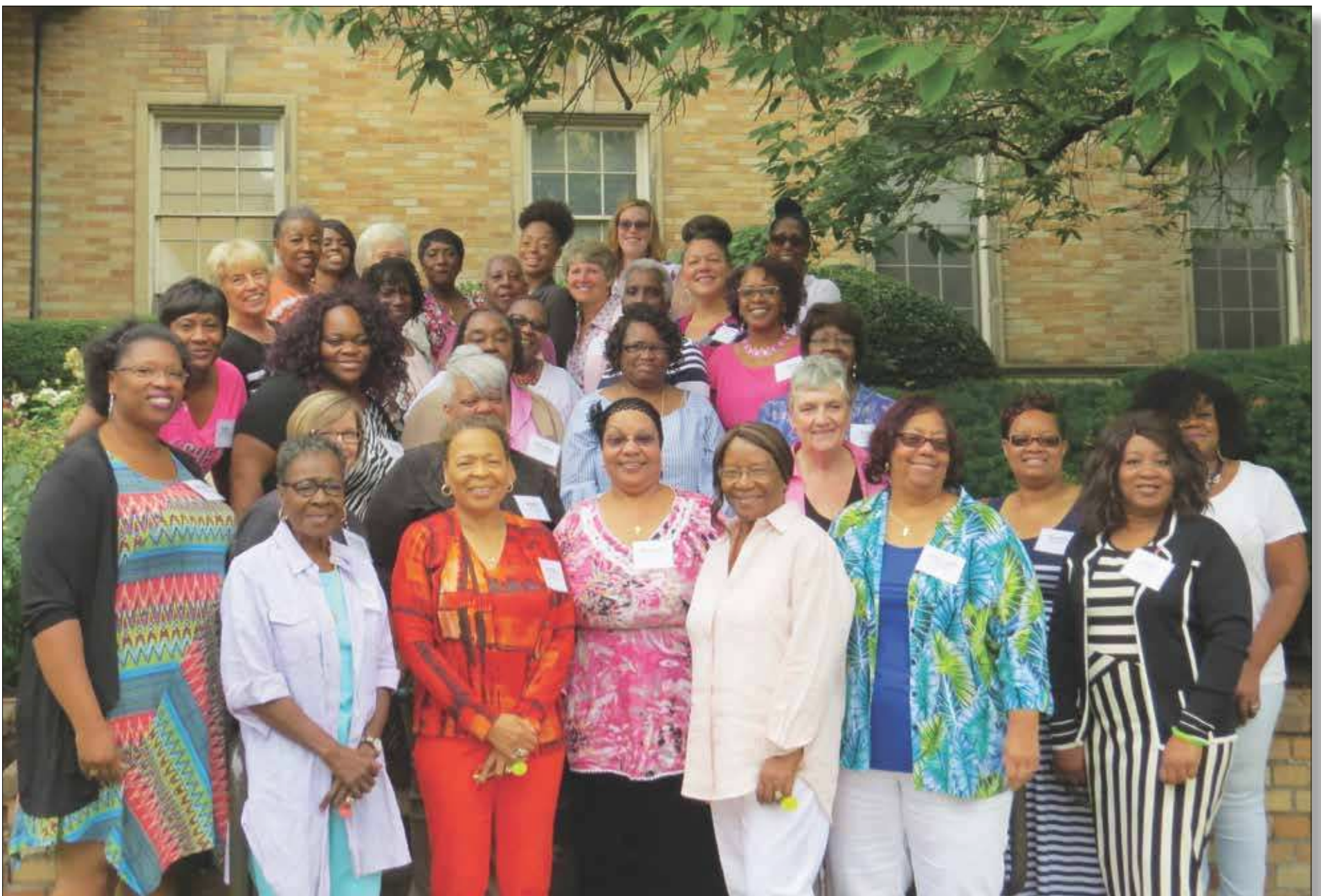
Volunteers signing up to help with breast cancer awareness and prevention in the African American community gather for a photo during a training summit last month. The group is part of Worship in Pink, a breast health education program for congregations of all faiths sponsored by the Susan B. Komen foundation of Oregon and southwest Washington.

Established in 1970 Committed to Cultural Diversity