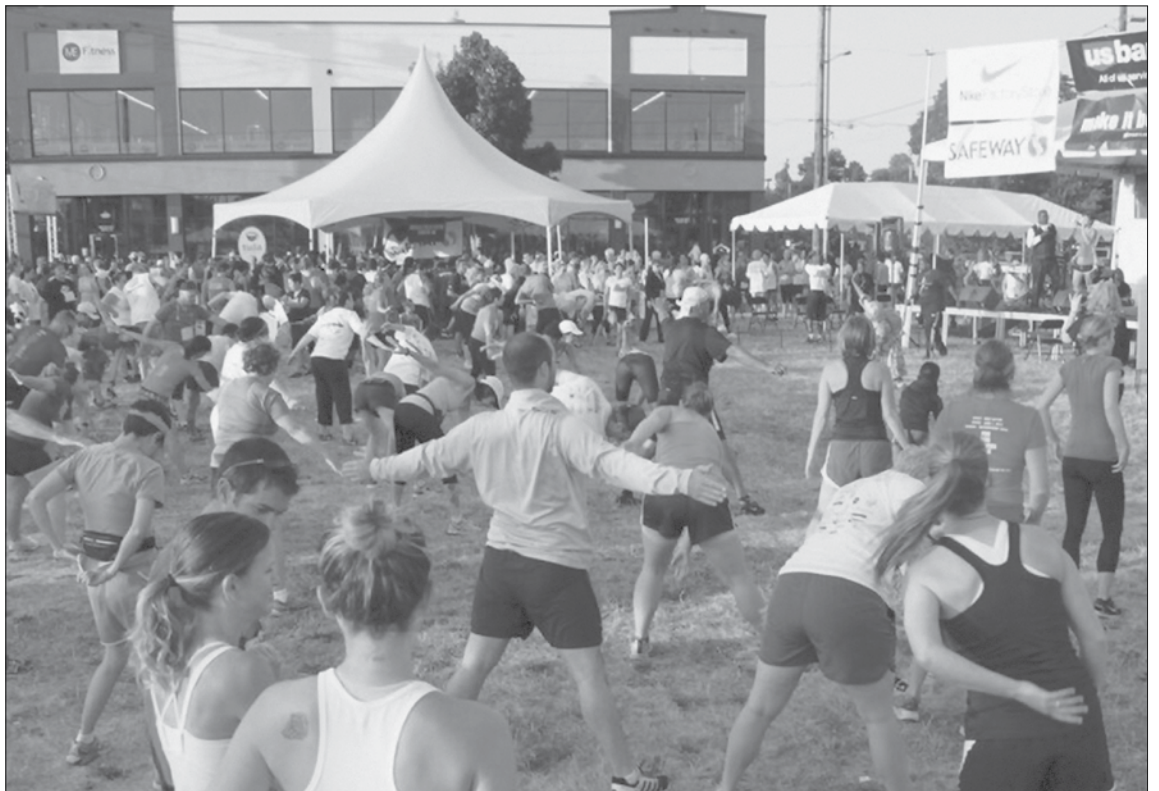
Participants warm up for the MLK Dream Run. The sixth annual event honoring Dr. Martin Luther King Jr. and his "I Have a Dream" speech returns on Sunday, Sept. 24.