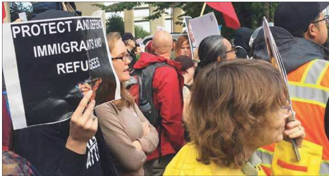
Protesters in Portland gather to oppose the harsh, anti-immigrant policies of the Trump Administration during a visit by Attorney General Jeff Sessions.