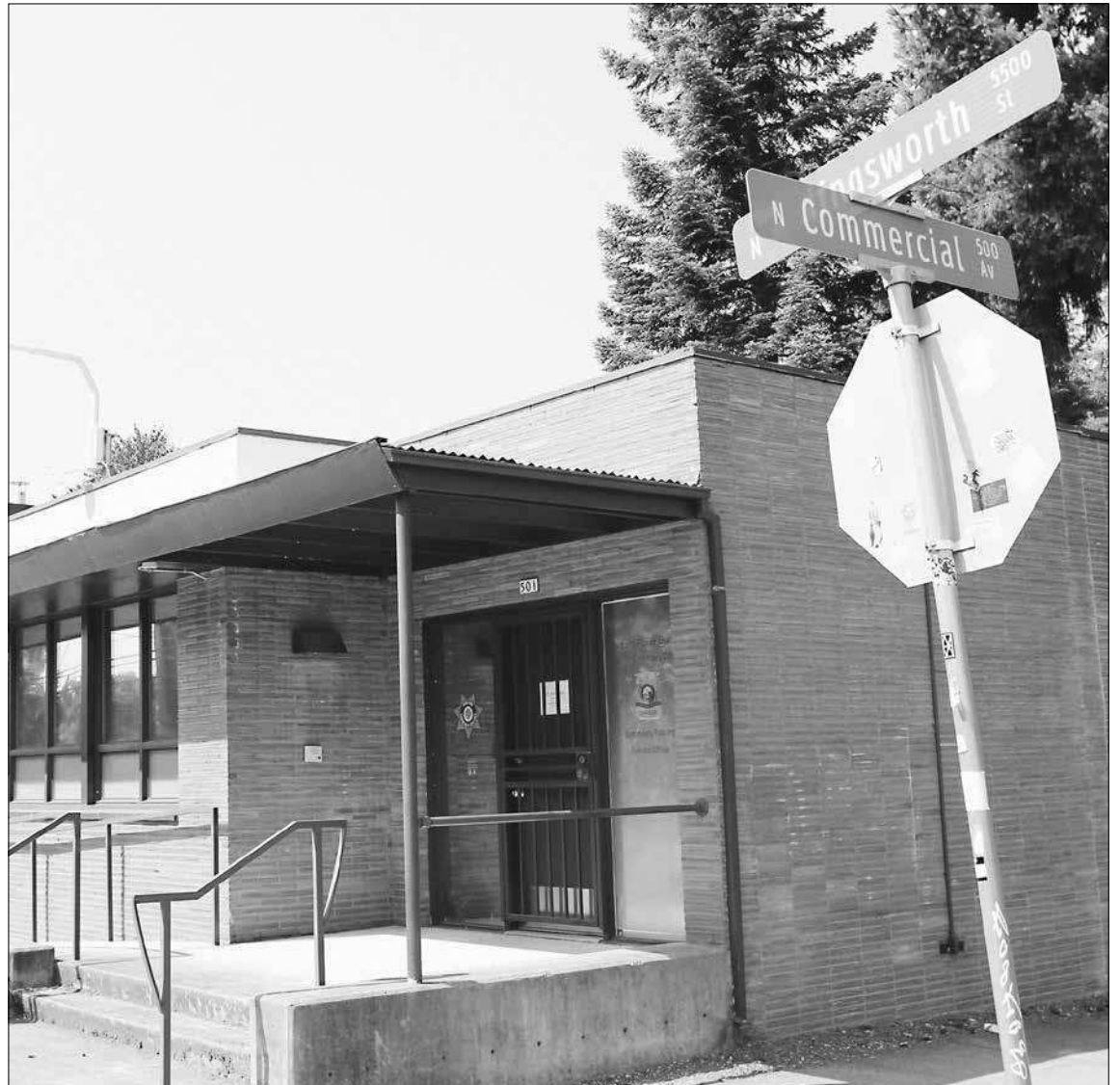
Portland Community College's Cascade Campus' aging public safety building on North Killingworth Street poses challenges for staff.