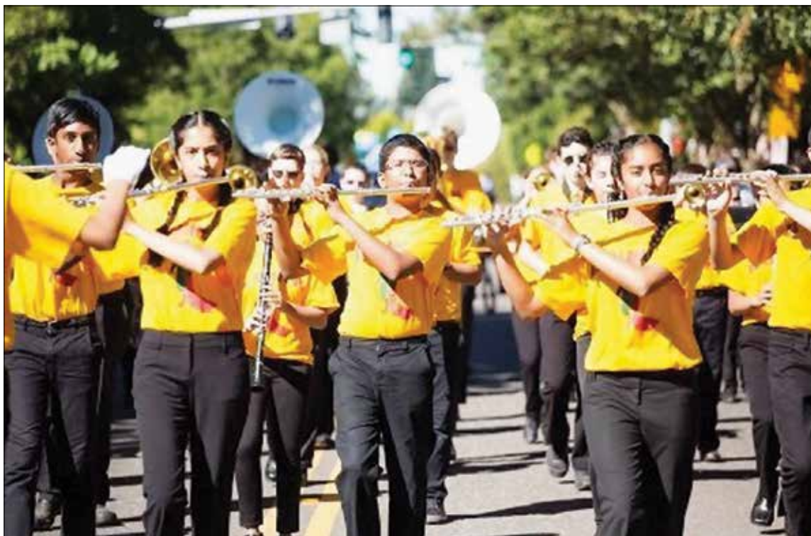
Beaverton honors its vibrant and diverse community with its annual Celebration Parade, with marching bands, festival floats, dance groups and more, returning Saturday, Sept. 9 from 9 a.m. to noon.