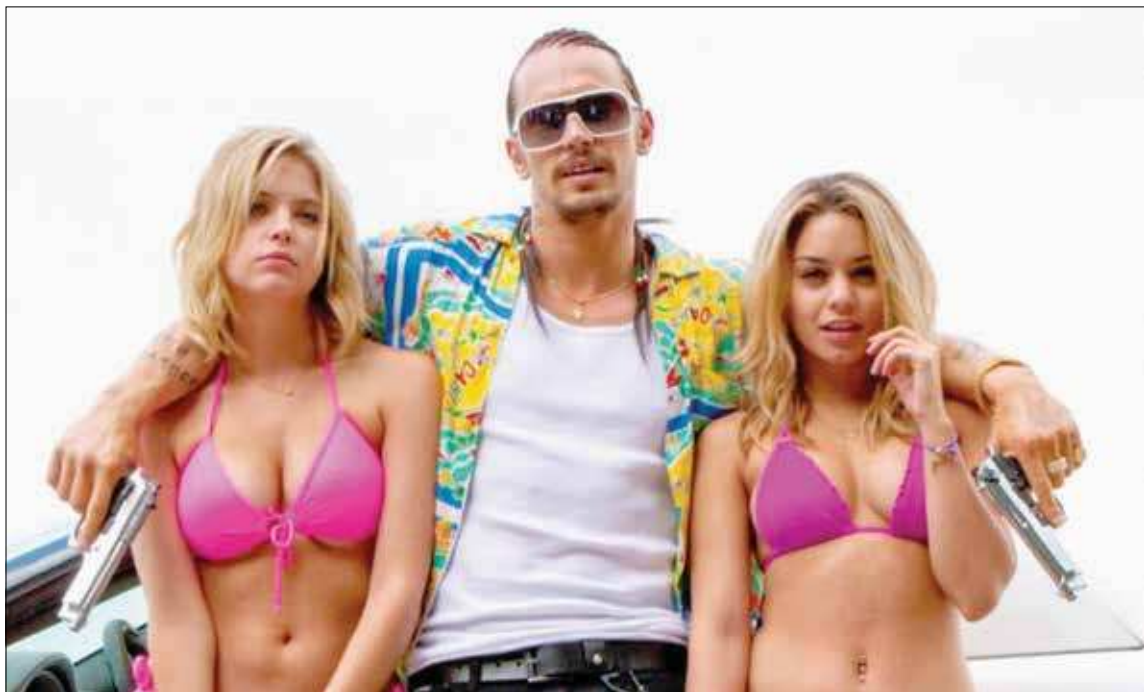
James Franco stars as a rapper/thug with somewhat veiled intentions, and Selena Gomez and Vanessa Hudgens are wild girls taken under his wing in "Spring Breakers."