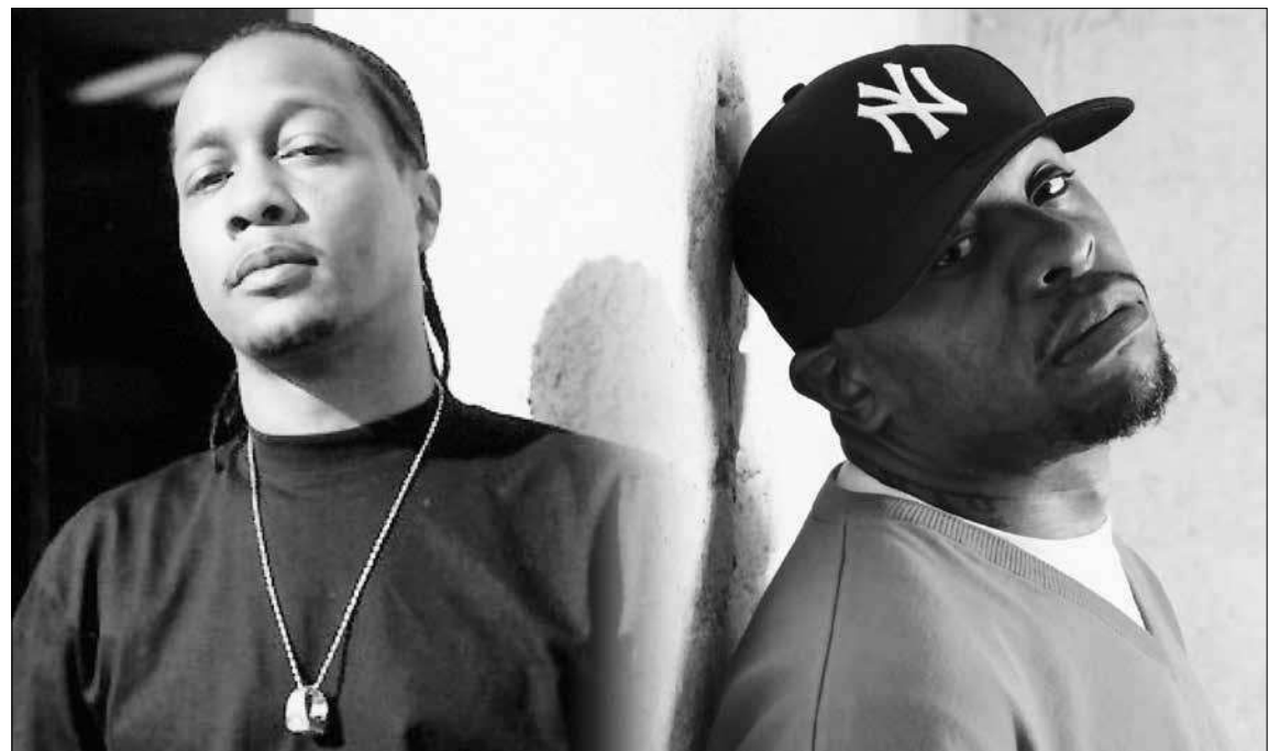
DJ Quik and Scarface