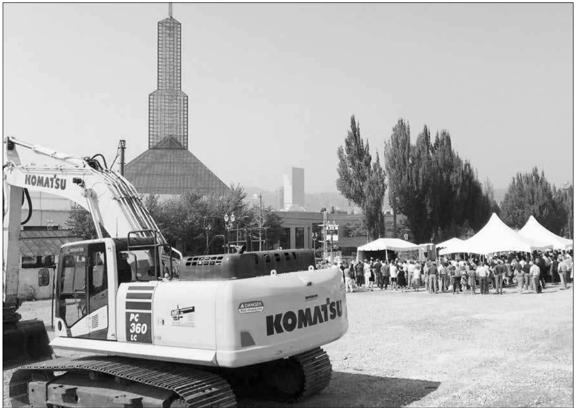
An Aug. 4 groundbreaking ceremony for a new Oregon Convention Center hotel takes place on the corner of Martin Luther King Jr. Boulevard and Holladay Street. The hotel is expected to create 3,000 jobs, 2,000 in construction and 950 in the hotel and hospitality industry.