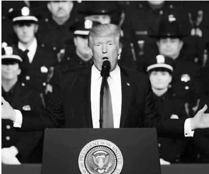
President Donald Trump encouraged police officers to be "rough" with people they arrest in a speech last week on dismantling the criminal gang known as MS-13 that was made before law enforcement in Long Island, N.Y.