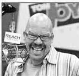
Tom Joyner 3am - 7am

KBMS Radio 1480 AM Portland's best music station