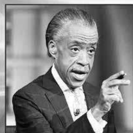
Rev. Al Sharpton 10am - 1pm