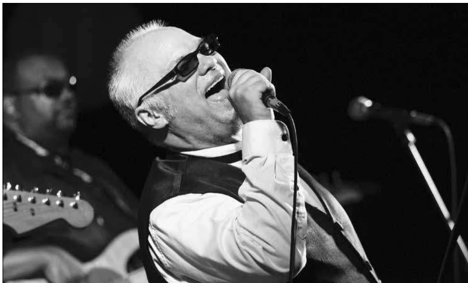
Soul, blues and R&B singer Curtis Salgado.

4747 NE MLK Jr. Blvd Portland, OR 97211 or call 503 740-1448