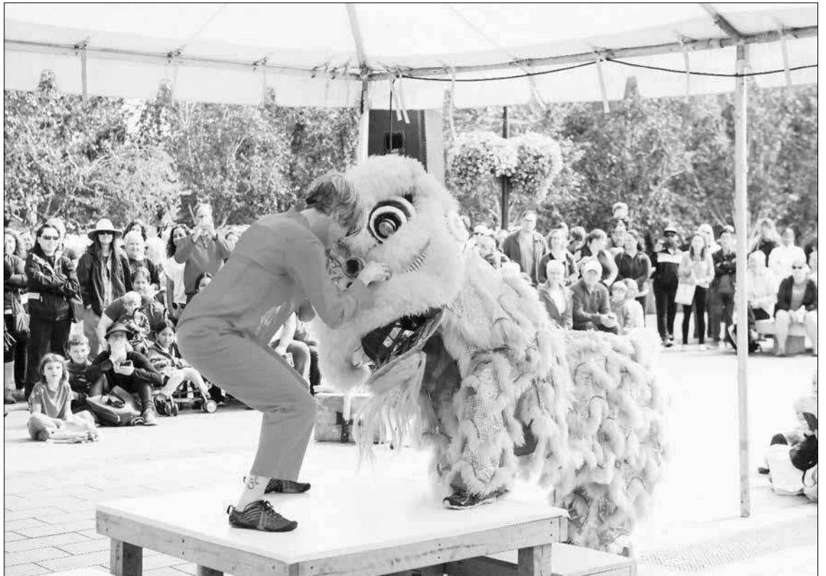
Chinese culture is depicted in a lion dance performed by the Northwest Dragon and Lion Dance Association. The group will participate with other traditional ethnic dancers when Ten Tiny Dances, a free public event is held on Saturday, July 8 at City Park in Beaverton.