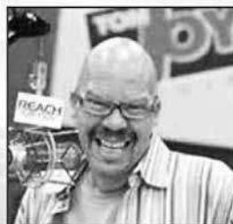
Tom Joyner 3am - 7am

KBMS Radio 1480 AM Portland's best music station