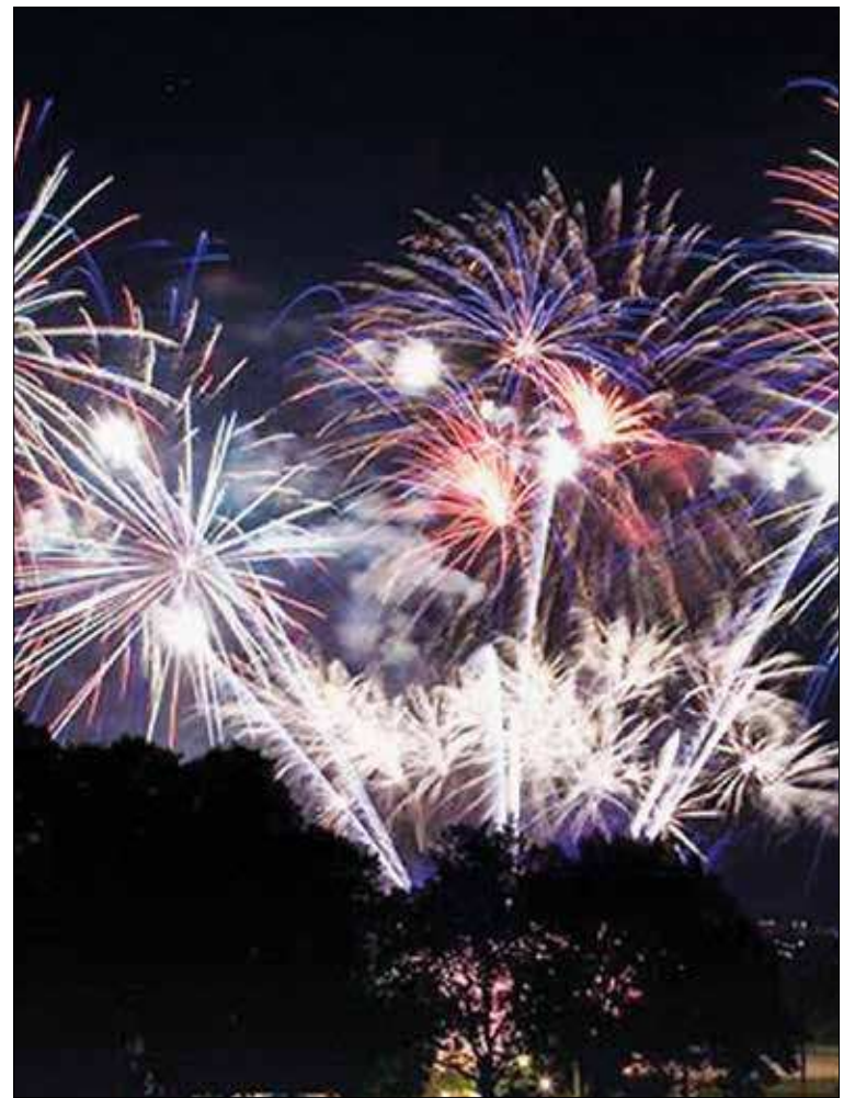
Independence Day at Fort Vancouver lights up the skies over the Columbia River.