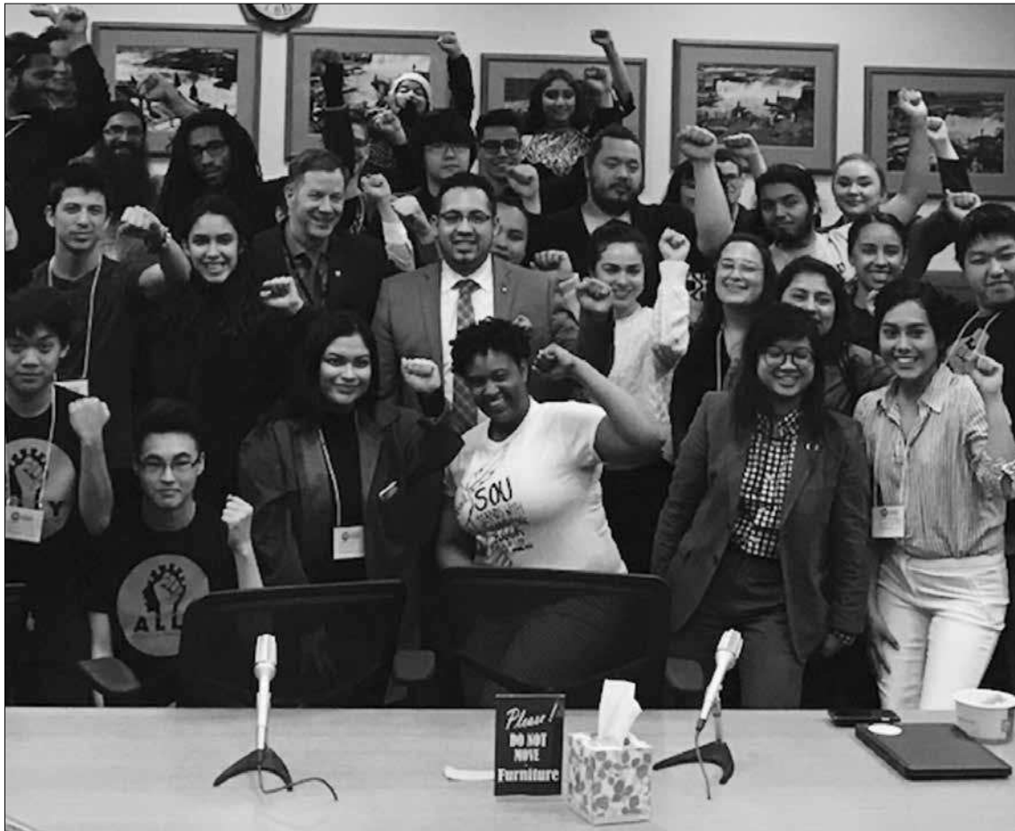
Oregon students led the passage of a bill creating ethnic studies in the state's K-12 schools.